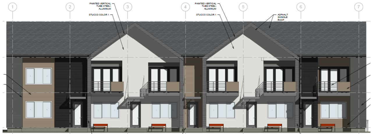
Proposed east elevation (not street facing)