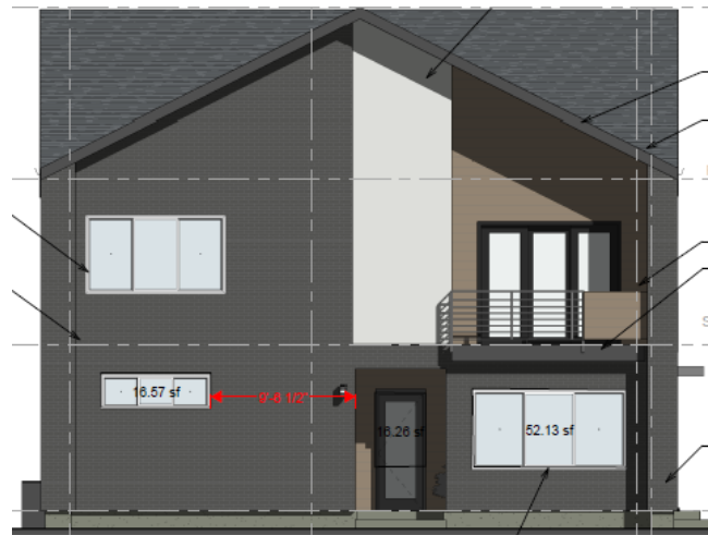
Proposed south (street facing) elevation.